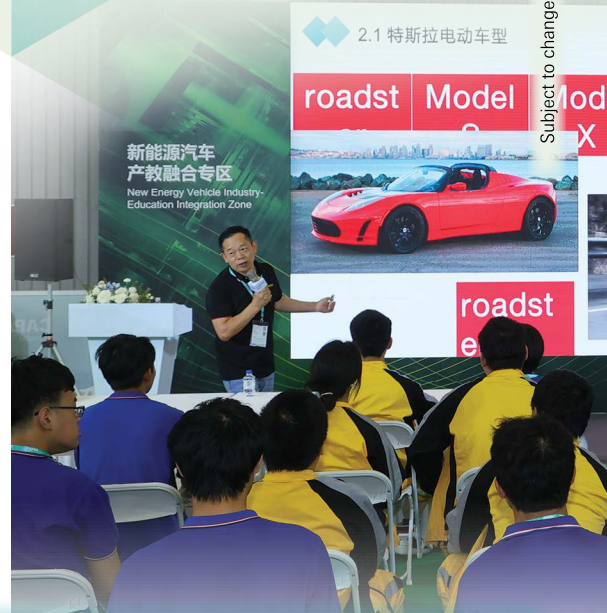
Subject to change, information as of March 2025