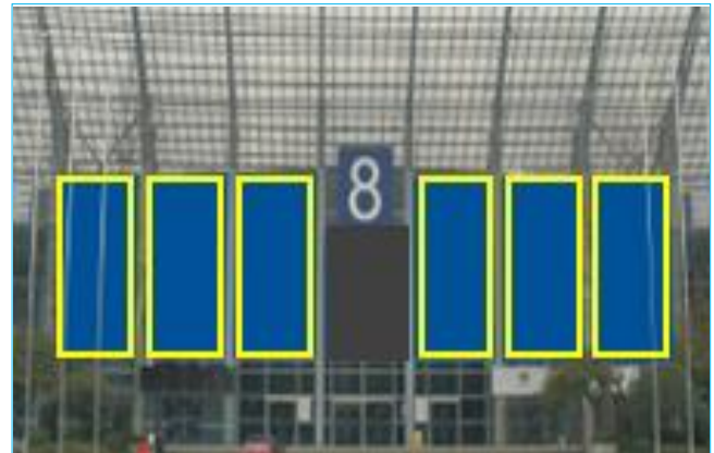
B01(b) Advertisement above hall entrances – S (vertical)

Specification: 10mH x 18.3mW Price: RMB 48,000 / pc