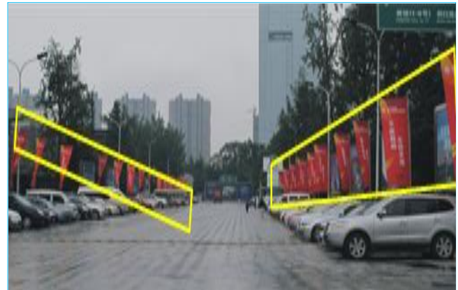
B05 Flag post along Rome Road

Specification: 4.5mH x 14.5mW Price: RMB 18,000 / pc