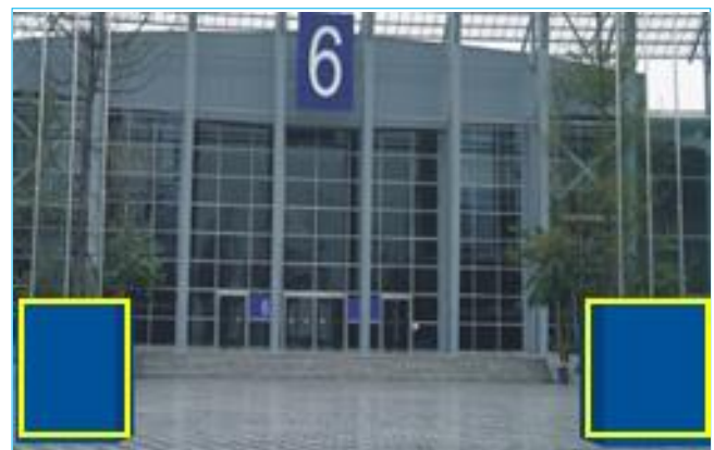
B03 Advertisement on flag stand in front of hall entrances

Specification: 10mH x 20mW Price: RMB 52,000 / pc