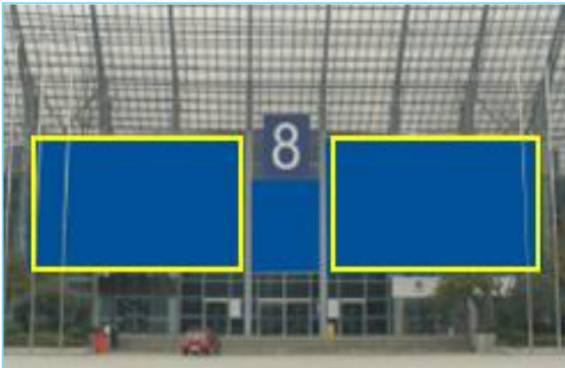
B01(a) Advertisement above hall entrances – L (horizontal)

Specification: 10mH x 18.3mW Price: RMB 48,000 / pc