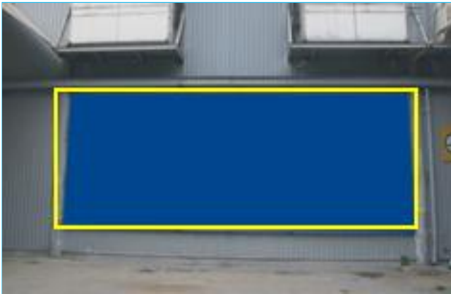
B04 Billboard at corridors connecting halls

Specification: 4.5mH x 14.5mW Price: RMB 18,000 / pc