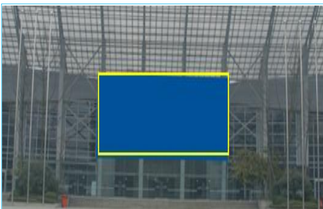
B02 Advertisement on connection to halls

Specification: 10mH x 5.7mW Price: RMB 16,000 / pc