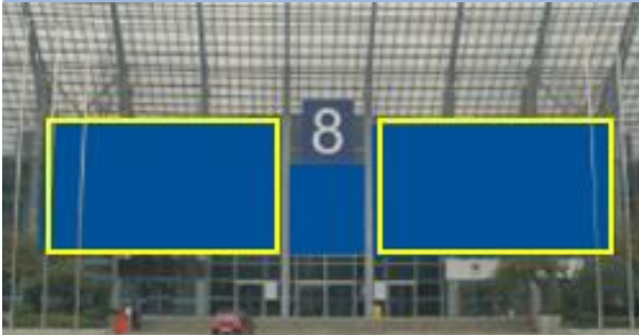
C01(a) Advertisement above hall entrances – L (horizontal)

Specification: 18.3m (W) x 10m (H) Price: RMB 48,000 / pcs