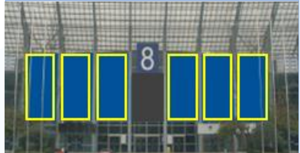
C01(b) Advertisement above hall entrances – S (vertical)

Specification: 18.3m (W) x 10m (H) Price: RMB 48,000 / pcs