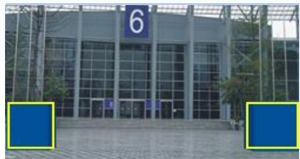
C03 Advertisement on flag stand in front of hall entrances

Specification: 20m (W) x 10m (H) Price: RMB 52,000 / pcs