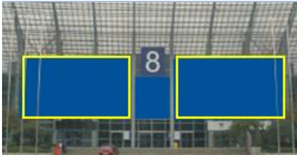
C01(a) Advertisement above hall entrances – L (horizontal)

Specification: 18.3m (W) x 10m (H) Price: RMB 48,000 / pcs