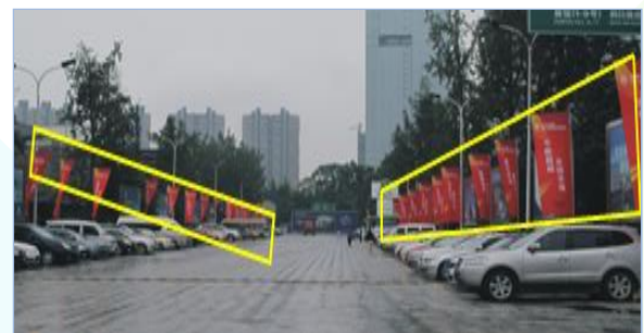
C05 Flag post along Rome Road

Specification: 14.5m (W) x 4.5m (H) Price: RMB 18,000 / pcs