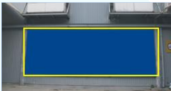
C04 Billboard at corridors connecting halls

Specification: 6m (W) x 4m (H) x 3-side / tower Price: RMB 27,000 / tower